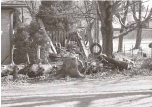
This property is not in compliance!

It takes a watchful eye from all residents to help me fulfill my obligation to you as Township Zoning Inspector.