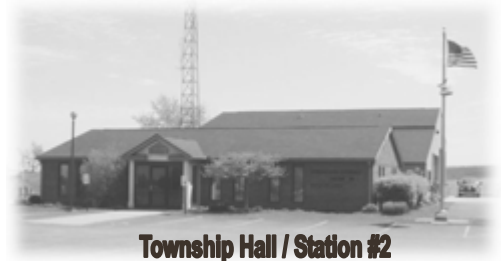
Township Hall / Station #2